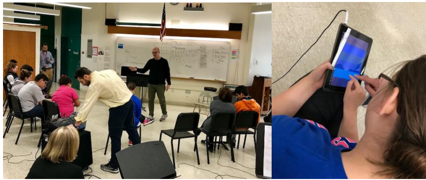
The beauty of WHS's inclusive 'Reach' Music Class